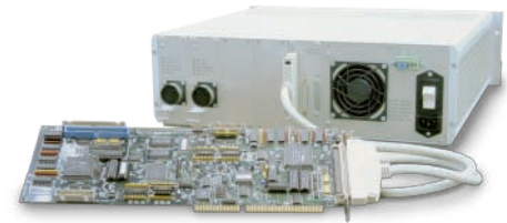
MDC400 Back View with Galil Motion Controller

Each drive card is terminated with a robust circular connector. Connection diagrams and cable assemblies are available for many applications.